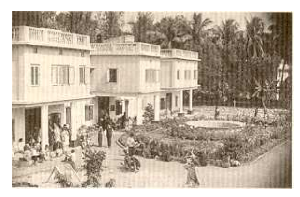
Netra Niramoy Niketan, Vivekananda Mission Ashram, Chaitanyapur

ract operations performed. In 1997 it was 91% of 3269 cataracts, and till June 1998 it was 96% of 1866 cataracts. In the last year the productivity rate is 892 surgery per ophthalmologist and the surgery per bed amounts to 50. The cost recovery in 1998 has crossed 150%.